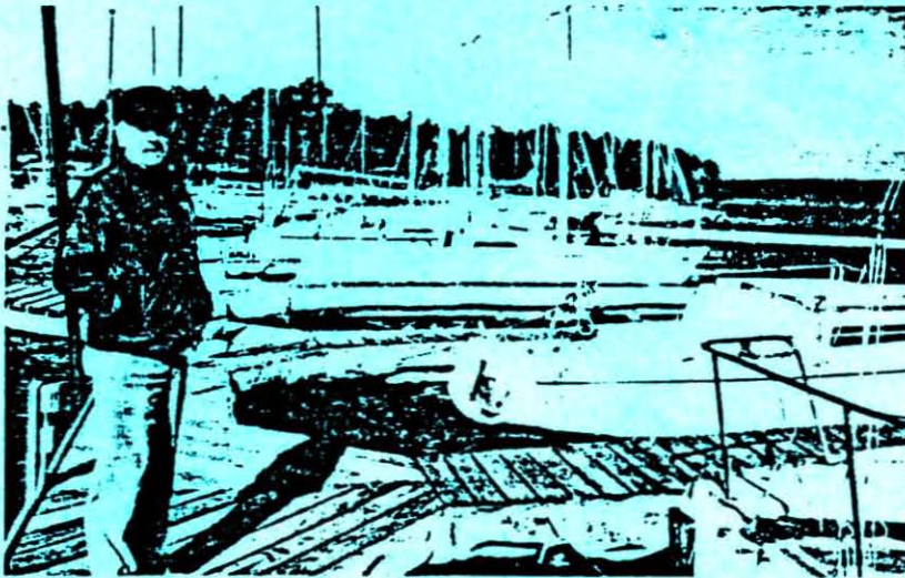
Past commodore Hal Daugherty admires GMSC's keelboat fleet. Centerboard boats and other club facilities are nestled among the trees in the background.

club-owned Optimist Prams help young newcomers develop skills and get their first taste of competition.