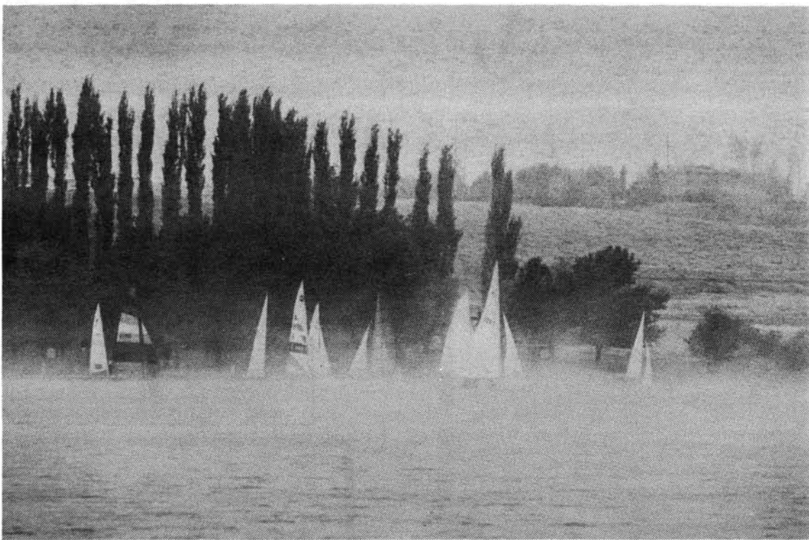
Ghost Fleet? Fog shrouds participating boats during Race 1 on October 29, 1995.